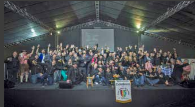
Workforce of EDAG do Brasil with Blumenau's male choir "Liederkrantz"