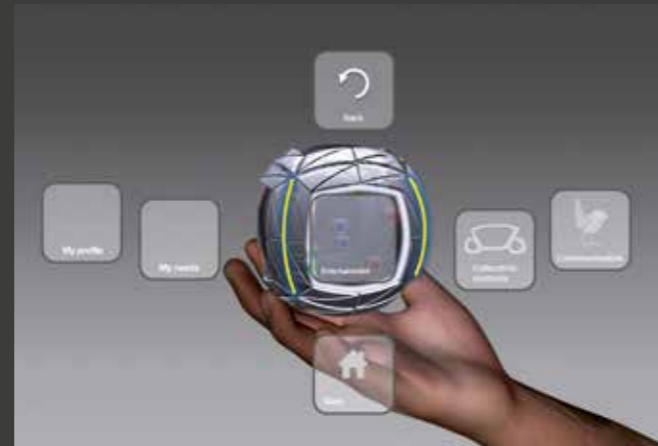
Innovative augmented reality interface to monitor the Collectivo features