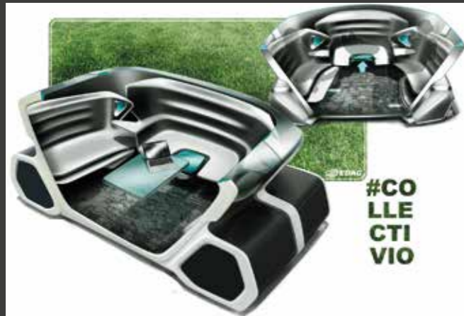
Adjustable interior: can be adapted to meet the requirements of autonomous driving

The results of the work of the individual teams and complete white papers are shortly to be published.