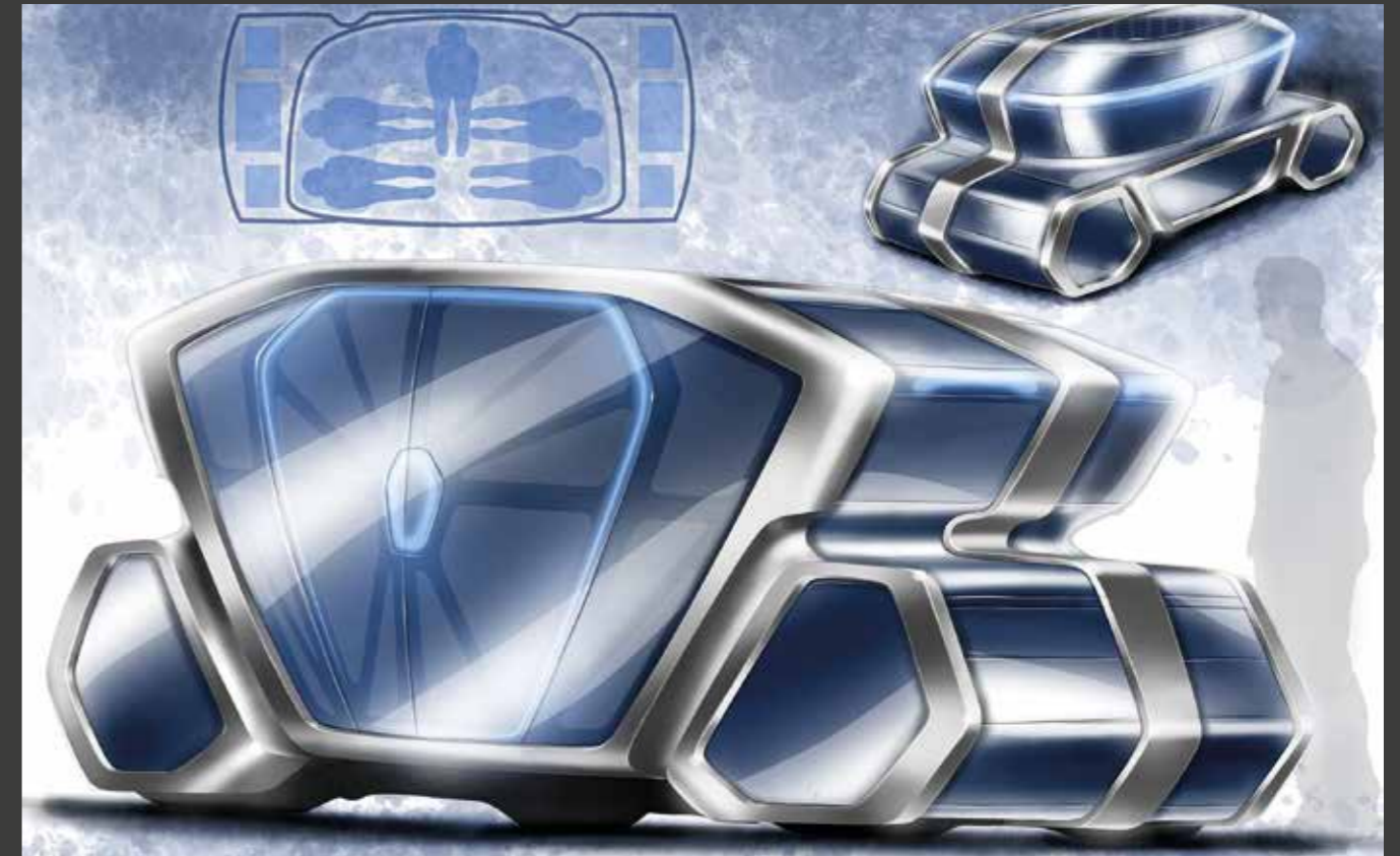
The exterior design of Collectivio

In the course of the 13 exhibition days, various design studies were presented to the community, changed according to their wishes, and finalized by means of a voting process in the social web. "The community feedback clearly showed us that people want more comfort and a relaxed atmosphere in Collectivio ; sporty characteristics and agility were not key requirements," according to designer Tom Hasenauer. "When designing the interior, for instance, we therefore decided in favor of a lounge-type back seat."